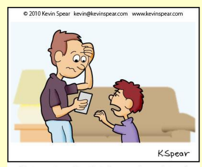
"Let me translate that for you. I speak text."