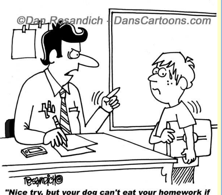
"Nice try, but your dog can't eat your homework if you're doing it all on your laptop!"